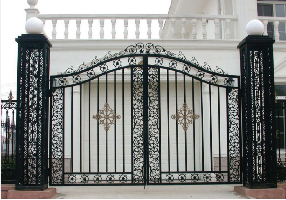
DUVAR ÜZERİ UYGULAMA Wall Over Applications